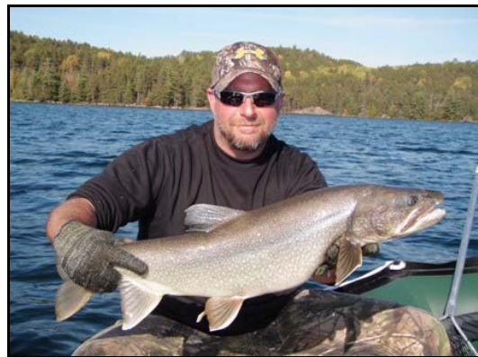
MNR crew member holding a tagged lake trout from Squeers Lake.